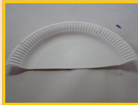
2. Cut it in half