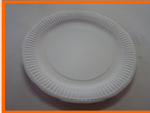
1. Start with a paper plate