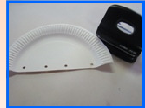
3. Punch 4 holes in it